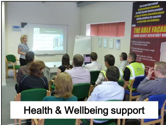
Health & Wellbeing support