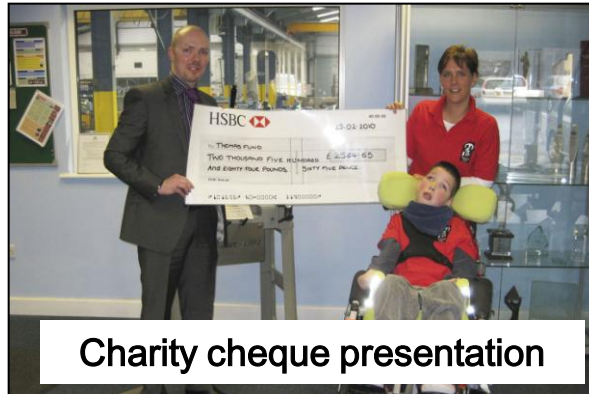
Charity cheque presentation