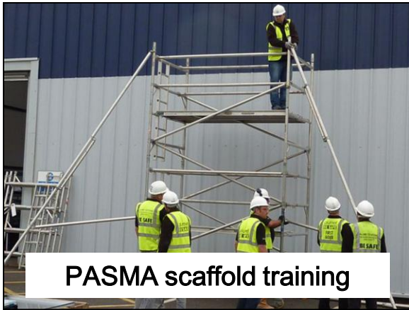
PASMA scaffold training