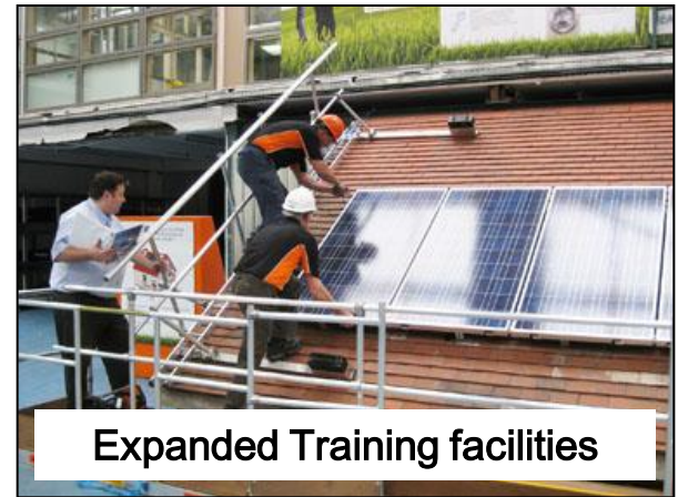
Expanded Training facilities