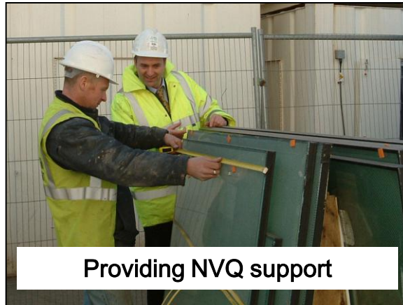
Providing NVQ support