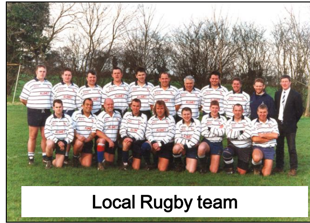
Local Rugby team