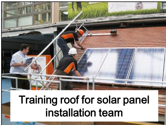
Training roof for solar panel installation team