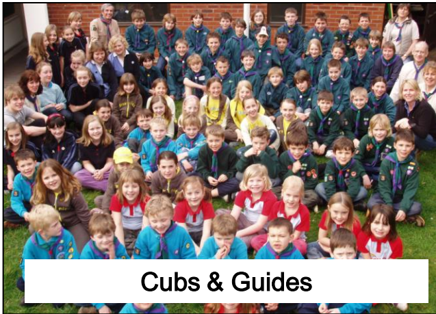
Cubs & Guides