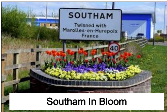
Southam In Bloom