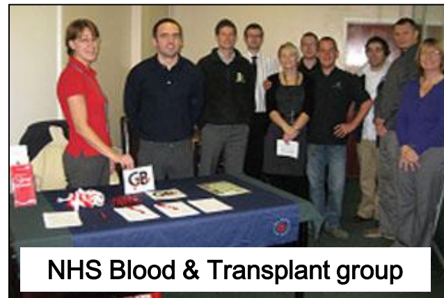
NHS Blood & Transplant group