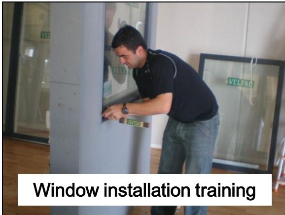
Window installation training