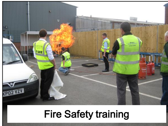
Fire Safety training