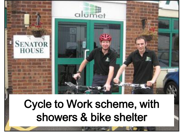
Cycle to Work scheme, with showers & bike shelter