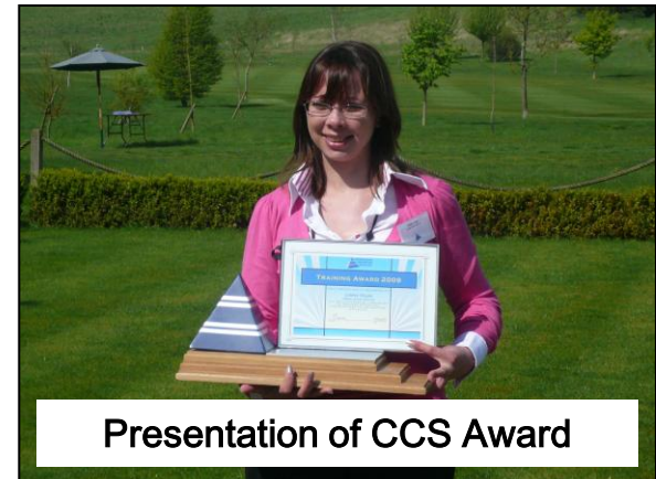
Presentation of CCS Award