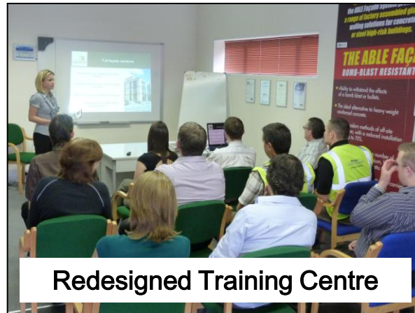
Redesigned Training Centre