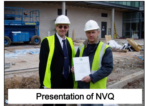
Presentation of NVQ