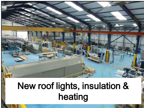
New roof lights, insulation & heating