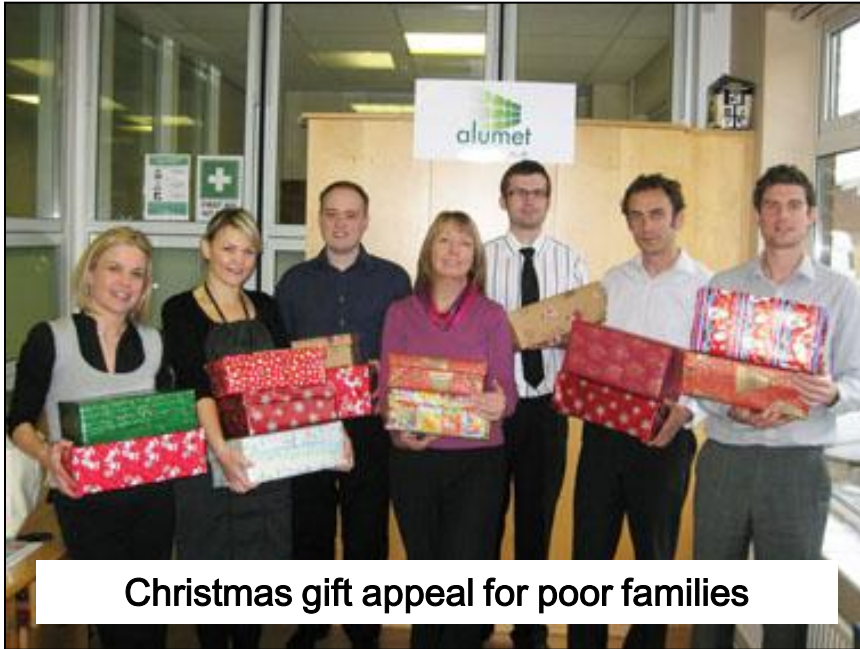
Christmas gift appeal for poor families